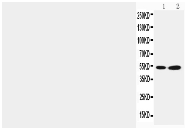
Anti-Selenium Binding Protein 1 antibody, ABO11526, Western blotting Lane 1: COLO320 Cell Lysate Lane 2: PANC Cell Lysate